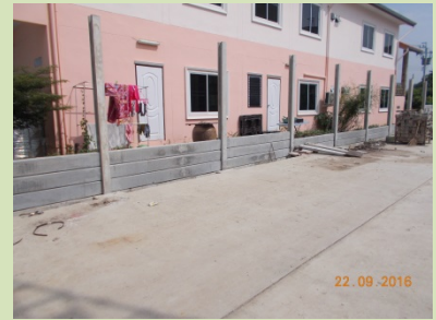
Back side fence