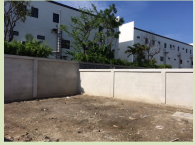
Main road fence