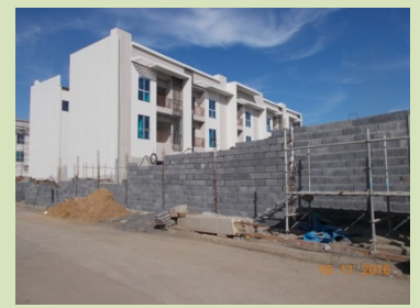
Main road fence