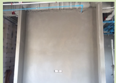
PLASTERING WORK (INTERNAL)