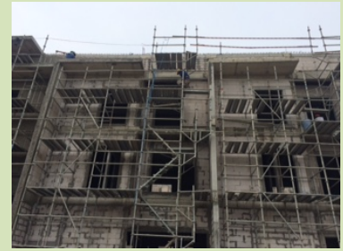
PLASTERING WORK (EXTERNAL)