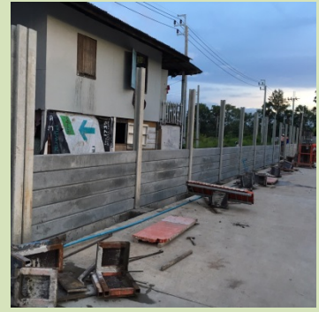
BACK SIDE FENCE